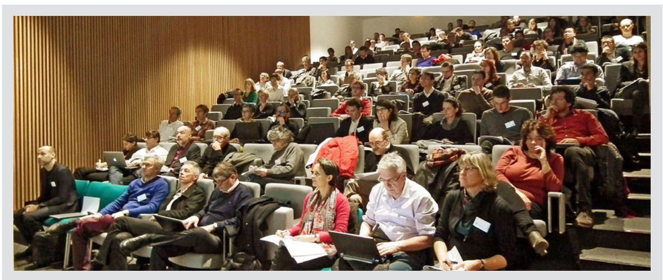
Figure 1: Impressions from the workshop.

In practice, in many industrial processes, particles – or fillers – are constituted of agglomerates of aggregates, and have to be efficiently dispersed in a polymer matrix. Thus the action of flow and thus the process have an important role on disaggregation and thus on final properties of the materials (Laurent Guy, Solvay). This process can be modeled thanks to Leonov inspired equations (Christian Carrot, IMP Saint-Etienne). It was