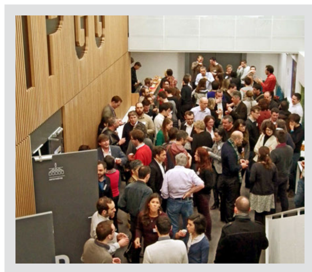
Figure 2: Participants during the poster session.