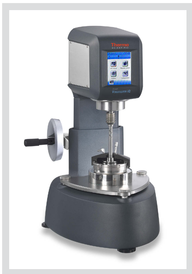
Figure 1: Thermo Scientific HAAKE Viscotester iQ.

Soft, spreadable foods such as cream cheese are viscoplastic materials. Consumer acceptance of these foods depends on their textural characteristics such as spreadability – a measure of how easily and uniformly they can be deformed and spread at end-use temperatures. It also determines if a given substrate like soft white bread will be able to withstand the spreading force.