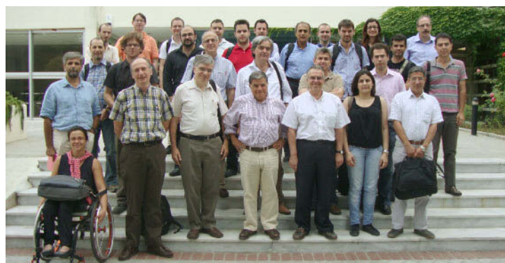
Figure 1 (left): A souvenir photograph of the HSR 2011 participants in front of Demokritos Convention Center, in Athens, Greece.