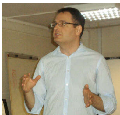
Figure 2: Yannis Dimakopoulos presents his plenary lecture on hemodynamics of the heart seen through numerical simulations.