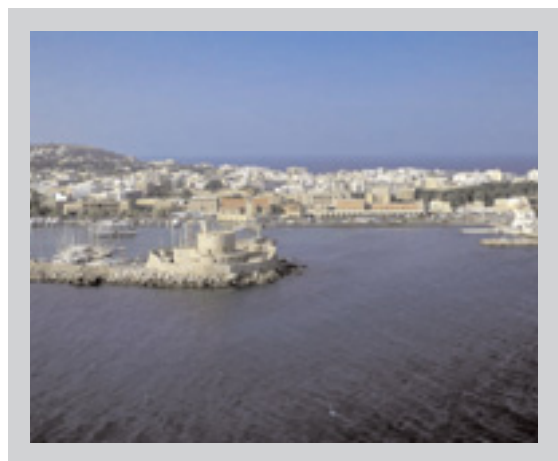
Figure 1: Port of Rhodes.

The application of thermodynamics to the rheology of complex fluids is by no means obvious. The international workshop IWNET 2006, jointly organized by FORTH-ICE/HT, the university of Patras and the Hellenic Society of Rheology highlighted the most recent advances in the related fields, in particular, new theoretical developments and state-of-the-art modeling/simulation techniques. The workshop took place in the vicinity of the medieval city of Rhodes, Greece from 2-7 September 2006.