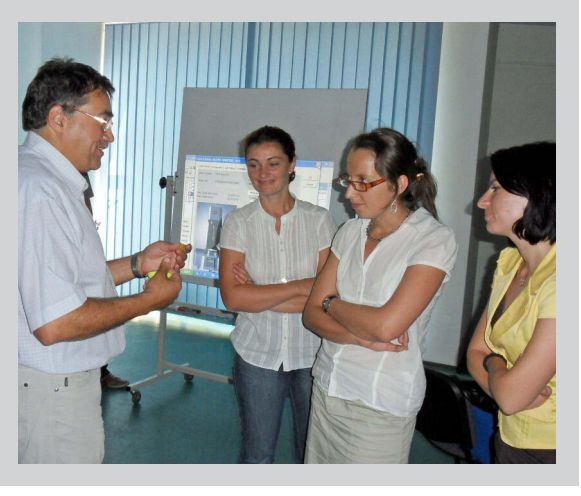
Figure 1 (above): The summer school was hosted by Babes-Bolyai University, "Universitas" Hotel (Cluj Napoca).