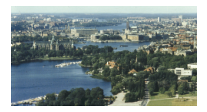
Stockholm, June 12-14, 2006